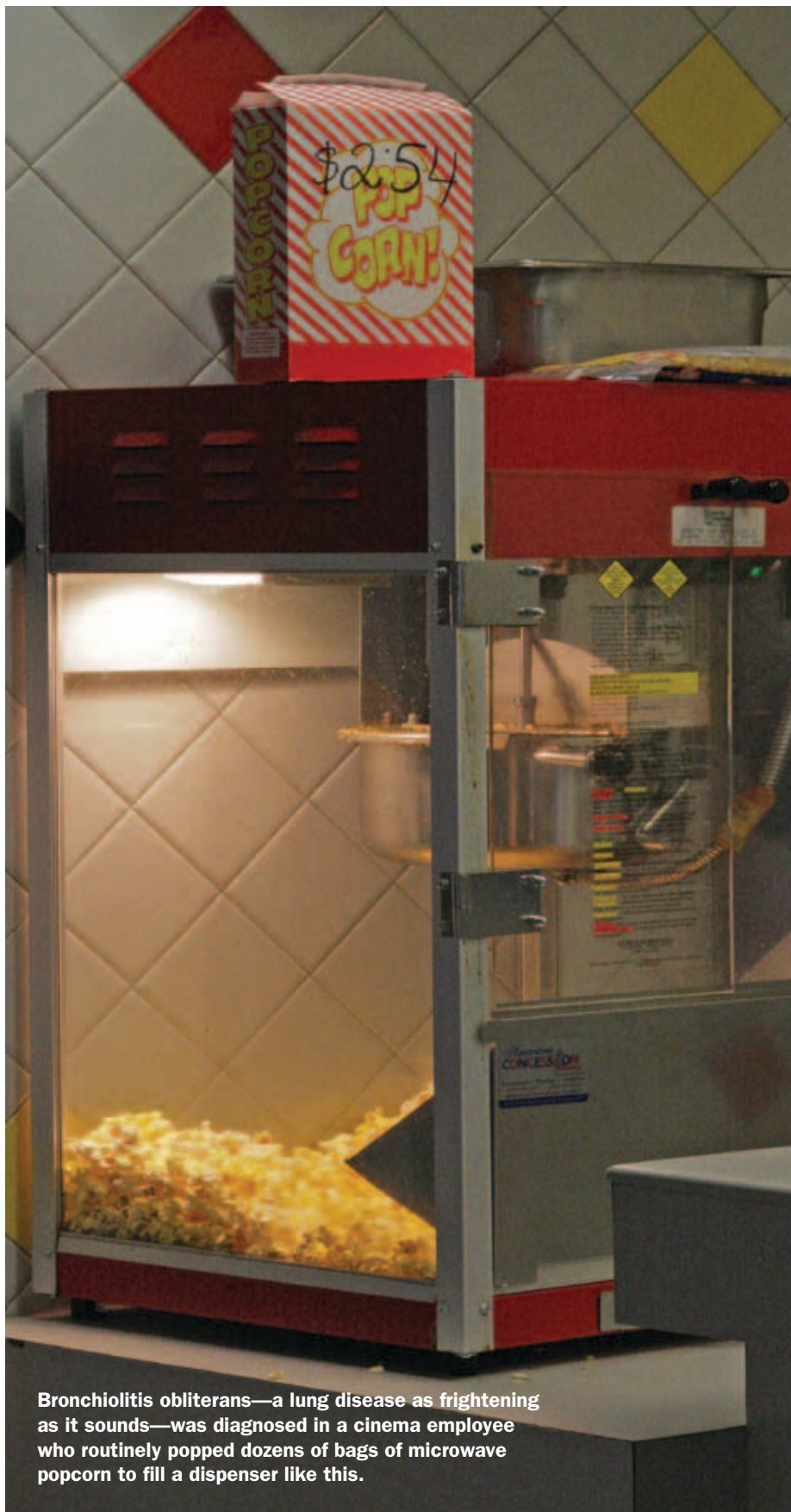
Bronchiolitis obliterans—a lung disease as frightening as it sounds—was diagnosed in a cinema employee who routinely popped dozens of bags of microwave popcorn to fill a dispenser like this.

While substitution is the preferred approach to protect not only workers but also the broader